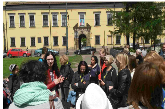
tour with a guide

Wednesday was the day when we were going to spend a night in the “Wieliczka Salt Mine”. But let’s start the day from the beginning. The day started again with a meeting at the school and we went to Cracow by bus. After arriving in Cracow we had a sightseeing tour with a guide. The tour was really interesting and after it we had free time in Cracow to explore the city a bit by ourselves. Then we had lunch.