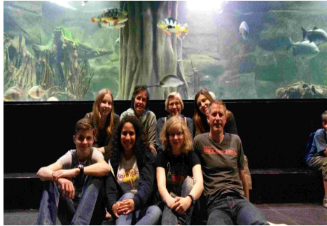
before the aquarium

The “Palm house” is a big indoor garden with an aquarium and an inside jungle. Before we had free time we had the task to take a picture of our group in front of the aquarium. After that we had time to get something to drink or eat and explore the “Palm house”.