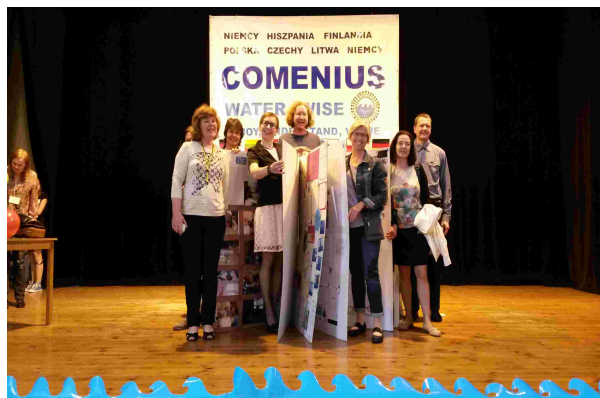
the group leader with the Water Atlas

It was time to present our “Water Atlas” on stage.