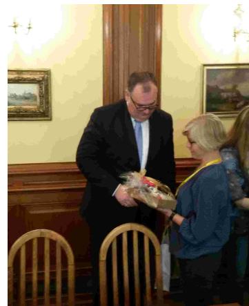
the mayor of Zabrze

After finishing the pages we made our way to the municipality at the town hall. At the town hall we watched a short movie about Zabrze and were able to ask some questions. We also got some flyers and a movie about Zabrze.