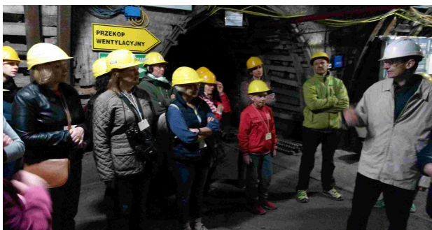
visiting the coal mine

Then we went to the GUIDO coal mine by bus. The coal mine is also in Zabrze. We had a guided tour and explored the mine. There was much to see like the old and new machines they used to mine the coal. It was really interesting.