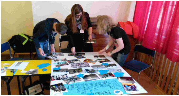
cut and stick in school

Then we headed back to the hotel and met our host families. We spend that evening with the families and did something interesting they planned for us.