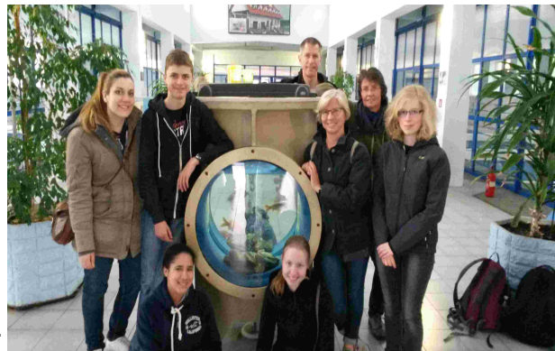
in the Water Purification Plant

On Thursday, after a delicious breakfast in the mine we went back to the sunlight and entered the bus to our next trip. The next point on our list was a visit in the “Water Purification Plant“, which is a waterworks institution. But there was a problem with the weather (lots of water from above!) so we had to quit the tour outside and finished it in the laboratories. In then laboratories we saw how the people work and test the quality of the water. We were allowed to test some things by ourselves, like what happens to the voice when you breath in a little bit of helium. This was a really funny experiment. Then we headed back to Zabrze and dressed up at our host homes for the farewell show.